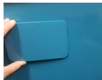
Examples of great samples Left: A paper paint sample Right: Paint on a hard surface (with matching gelcoat underneath)

Once you have your sample ready, please mail to address below and notify the Production team at production@happiercamper.com .