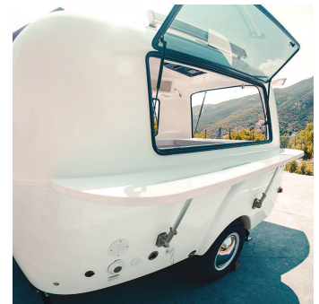
POWER OPTIONS FOR COMMERCIAL USAGE