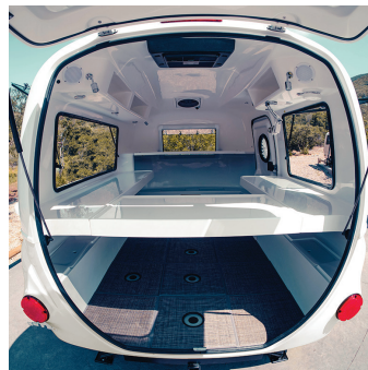
VEND WITH INTERIOR SERVING BAR