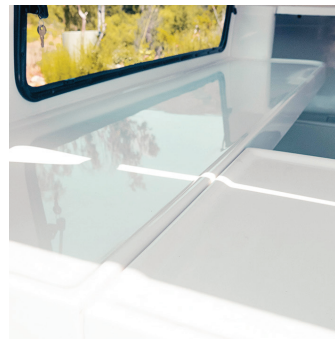
FIBERGLASS PERFECT FOR FOOD SERVICE