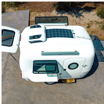
ELEVATED DESIGN CATCHES ATTENTION