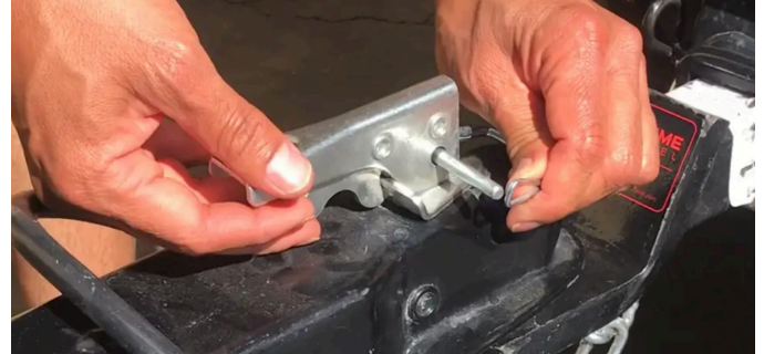
Secure the coupler to the 2" ball using the latch pin.