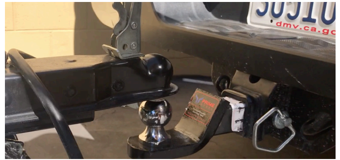
Align and lower coupler onto the trailer ball.

Important: Check your brake lights, left and right blinkers, and emergency lights to confirm they are working.