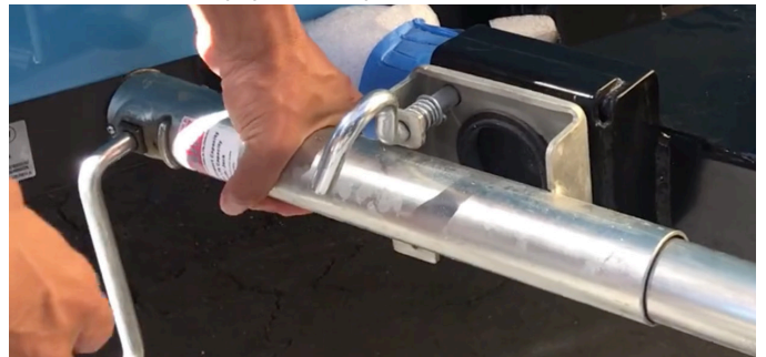
Ensure the jack wheel is securely locked in the upright position.