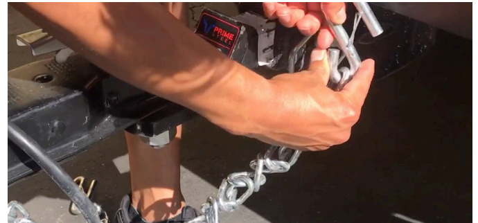
Twist safety chains before attaching them to the trailer hitch.