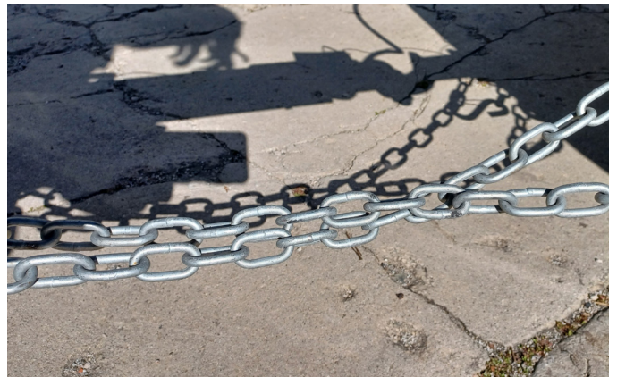
Do a safety check before you leave to make sure your chains/cables are crossed to form an "X"!